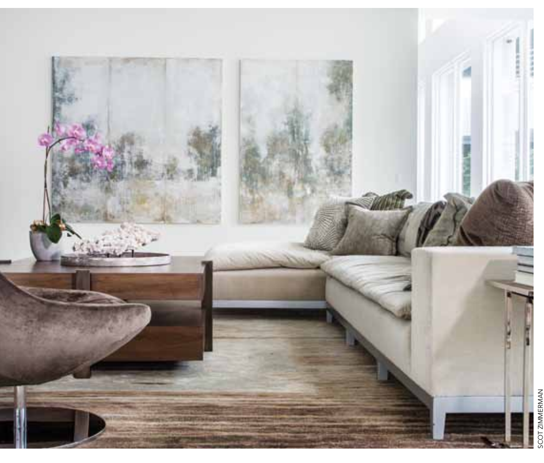
Designer Anne-Marie Barton created a collection of elegant custom pillows to help unify the natural tones and organic textures of this modern family room.