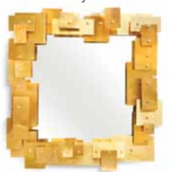
Puzzle mirror, $1,950, Jonathan Adler, jonathanadler.com

UPON REFLECTION Shapely mirrors make magic in rooms of all sizes and styles