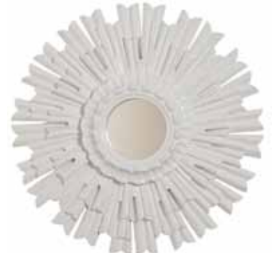
White sunburst mirror, $279, Ethan Allen, Boca Raton

[bocamag.com] 115 follow the leader may/june 2015