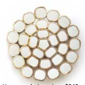
Honeycomb ring mirror, $248, Anthropologie, Boca Raton