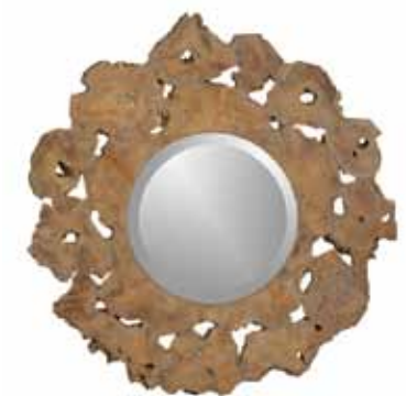
Root wall mirror, $499, Crate & Barrel, Boca Raton