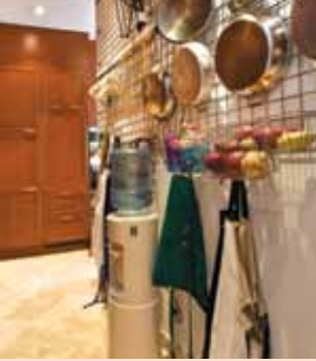
HANGING OUT A wall-mounted, chrome-plated grid provides abundant hanging space for aprons, pans and oversized equipment in the pantry.