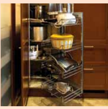
TRICKS OF THE TRADE A specialized rack extends from corner cabinetry creating easy access to stored appliances.