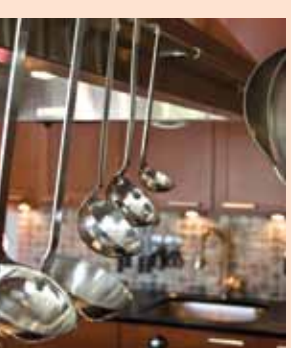
UTENSILS WITHIN REACH A rod encircles the large vent hood providing a spot to hang much-used cooking utensils