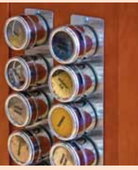
SPICE IS RIGHT Magnetized spice containers are conveniently positioned on the side of the dual-chef cooking island.