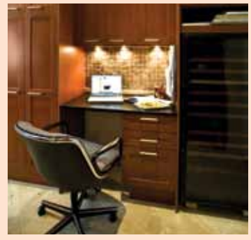
SPACE SAVER This integrated desk features pullout file drawers and sits adjacent to the wine cooler.