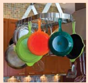
POT SHOTS Easy-to-reach pans hang above the cooking island, adding color and convenience to the room.